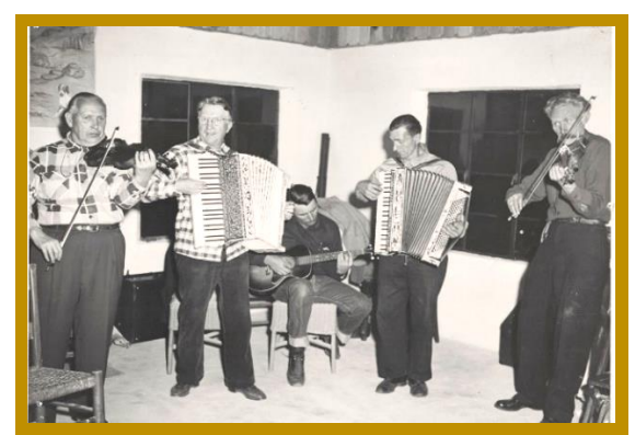
Pot Luck AND Music! Good ol' 1952!