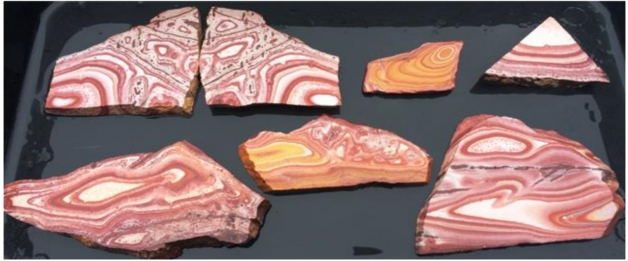
Examples of Wonderstone aka Bull's Eye RHYOPLITE

The last weekend of September, CGMS hosted the CO-OP field trip to Fallon, NV. I would like to thank all of our members for their strong turnout. It was nice to see all the new faces! It was the best turn out in years!! We had twenty-one people the first day and fifteen the second day. Saturday, we collected jaspers, crystals and calcite.