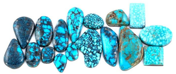
KINGMAN MINE TURQUOISE