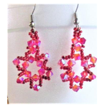
Copper Cala Lilies Swarovski Snowflakes