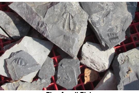
Fine fossil Fish