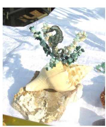
Pat Gulyas' Coral Wire Sculpture