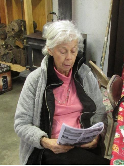
We now have proof that someone actually reads the NEWSLETTER!! Thanks, Veda!