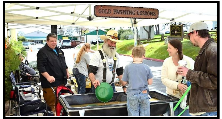
Delta Gold Diggers and FREE GOLD PANNING LESSONS...look at those smiles!