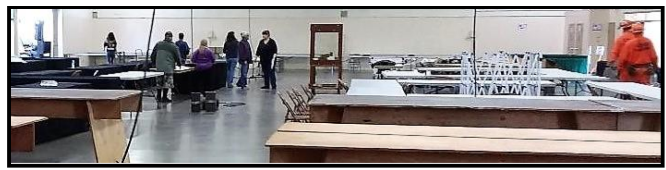
Crisis #141 began at 9 am on Thursday when we arrived to find that nothing had been pre-done for our arrival - due to new heaters being installed on Wednesday (our usual behind-the-scenes-day) thus pushing all the tasks forward into Thursday - where we all converged into the hall at the same time...Fair personnel, CDF inmate crew, club trailers, club helpers, and rocks.