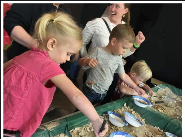
This totally sums up the looks on all of our parents' faces in our Kid's Area!