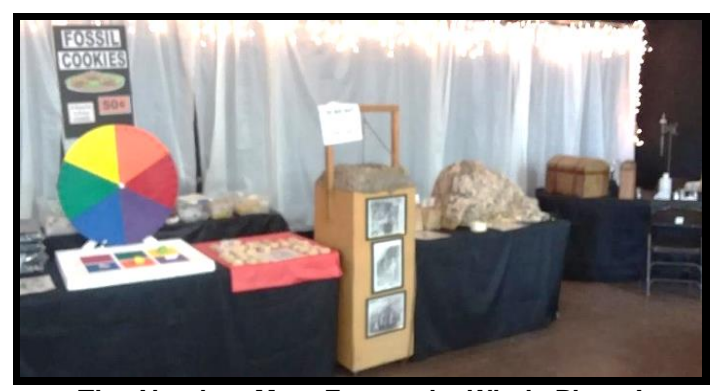
The Absolute Most Fun on the Whole Planet! Spinning wheel, Fossil Cookies, Mine Shaft, Sand Mining, Pony Treasure Mountain and our Alchemist!