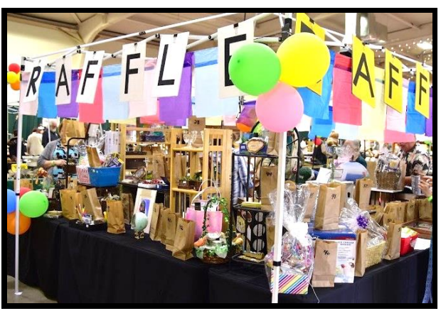
I would like a STANDING OVATION for all our Raffle Prize donators...to you who have faithfully donated to many of our 43 Annual Shows and then, to our brand-new members who went above and beyond! What a Team! What a Raffle!