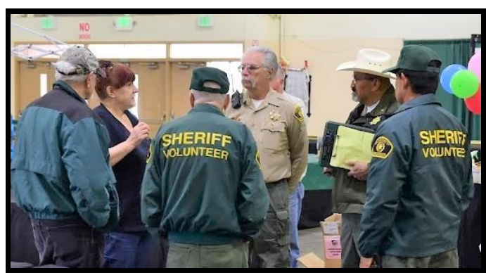
I adore these guys (and gals)...Did you know that you do NOT have to be former law enforcement to serve as a Volunteer Sheriff? That's what their recruitment table at our show was all about! And, they NEED more volunteers!