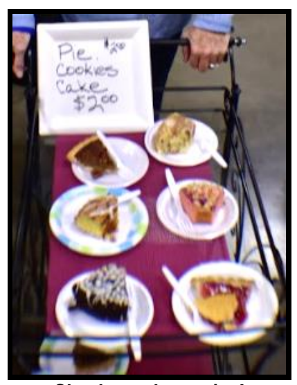
Check out those pies!