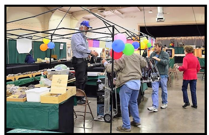
Eventually the tables reached their final positions and set-up moved forward in earnest, like a well-oiled machine...well, we did have some huffin' & puffin' at times...but the Reeves plying the team with food and drink at lunchtime helped them push on to the finish!