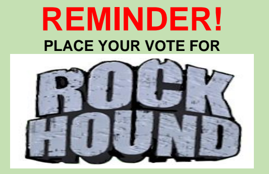
of the YEAR. BALLOT BOX is on the front desk.

The bench is ready and will need about $50 in concrete and materials to secure it outside the clubhouse. Loretta Pagni motioned we allot the $50 and Brad Becker seconded. Motion passed. A volunteer crew will do the honors of installing the bench.