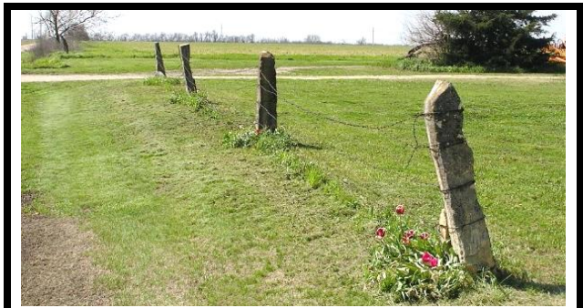
The holes for the posts were dug by hand every 15 feet to a depth of 24+ inches. There were about 320 posts per mile.