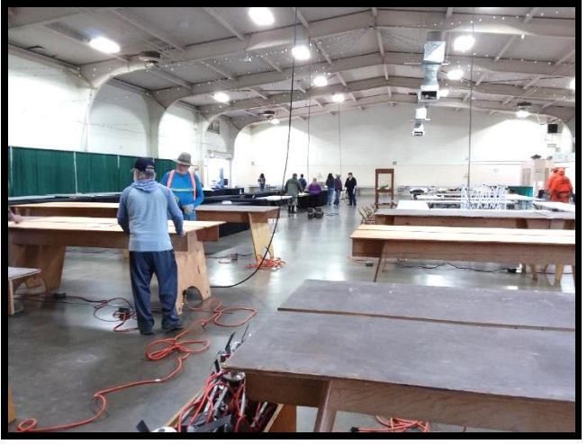
then the ladies took over.

The carefully labeled plastic storage containers holding the heavy green plastic sheeting was opened and with the precision of a military drill team, skirting began.