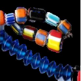
Ancient Phoenician Glass Beads