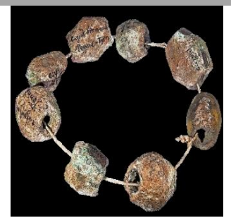
Bronze Age: rock