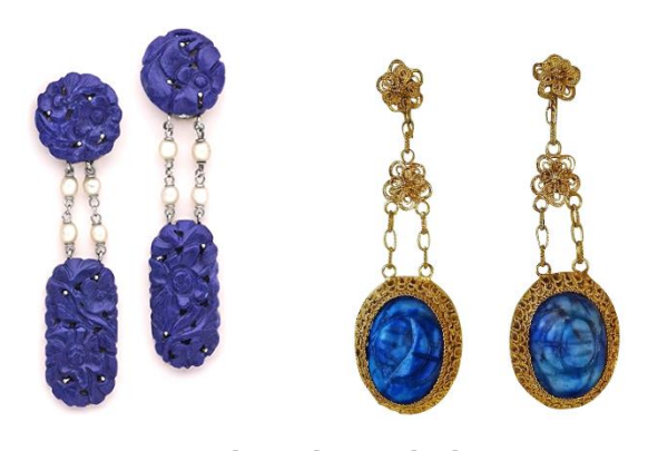
Lapis at its artistic best!