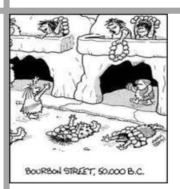
10,000-year-old beaded clothing